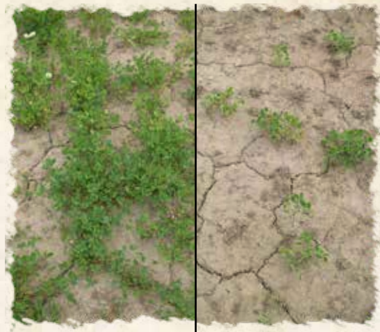
FIXATION BALANSA CLOVER VS. CRIMSON CLOVER

Broadcast seeding on unprepared seedbed 60 days after seeding (planted May 11, 2011).